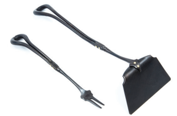
Rachel Keding Garden Tools , 2016