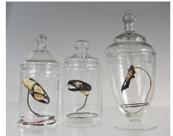
Kest Schwartzman Falcon Mask for a Mink, Mink Mask for a Chicken, and Chicken Mask for a Mole , 2018