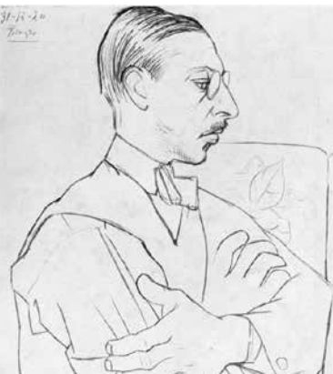
Igor Stravinsky as drawn by Pablo Picasso 31 Dec 1920